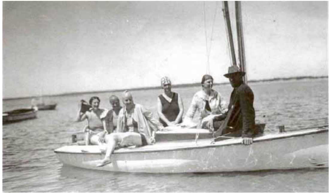
Early 1930s

SGYC is renowned for its friendly atmosphere and although we are a small regional club you will find we have a big heart so pack up that beautiful craft sitting in the garage and head for Inverloch for Australia day weekend.