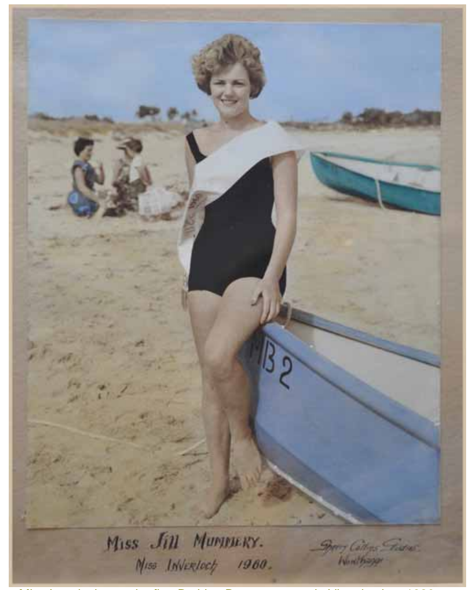
Miss Inverloch was the first Bathing Beauty contest in Victoria circa 1920.