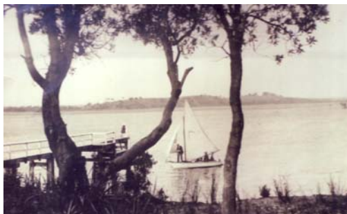
Sailing across Anderson Inlet and landing at Point Smyth in 1926.

You are invited to participate in the Regatta's sailing, boat displays and social program which provides for people to get together, meet old friends and make new acquaintances. The 2017 Regatta is envisaged to be an outstanding regatta for the participants, whether sailing their wooden dinghies or displaying them for all to see. Participants will be provided with the opportunity to enjoy a social sail up the inlet and also test their skills in the Regatta race which is dedicated to classic wooden dinghies. There will be displays of classic wooden dinghies for the public and awards will be provided to most worthy winners of the various categories.