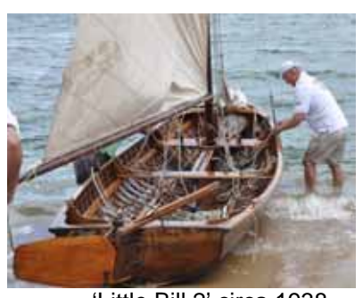
'Little Bill 2' circa 1938