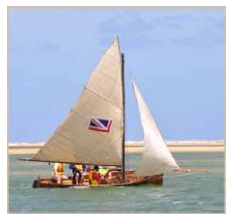
Tony Siddon's 1934 16 ft skiff 'Little Bill 2'. Rotary Club Plaque and UK Halsey kit bag for Best Dinghy in Original Condition