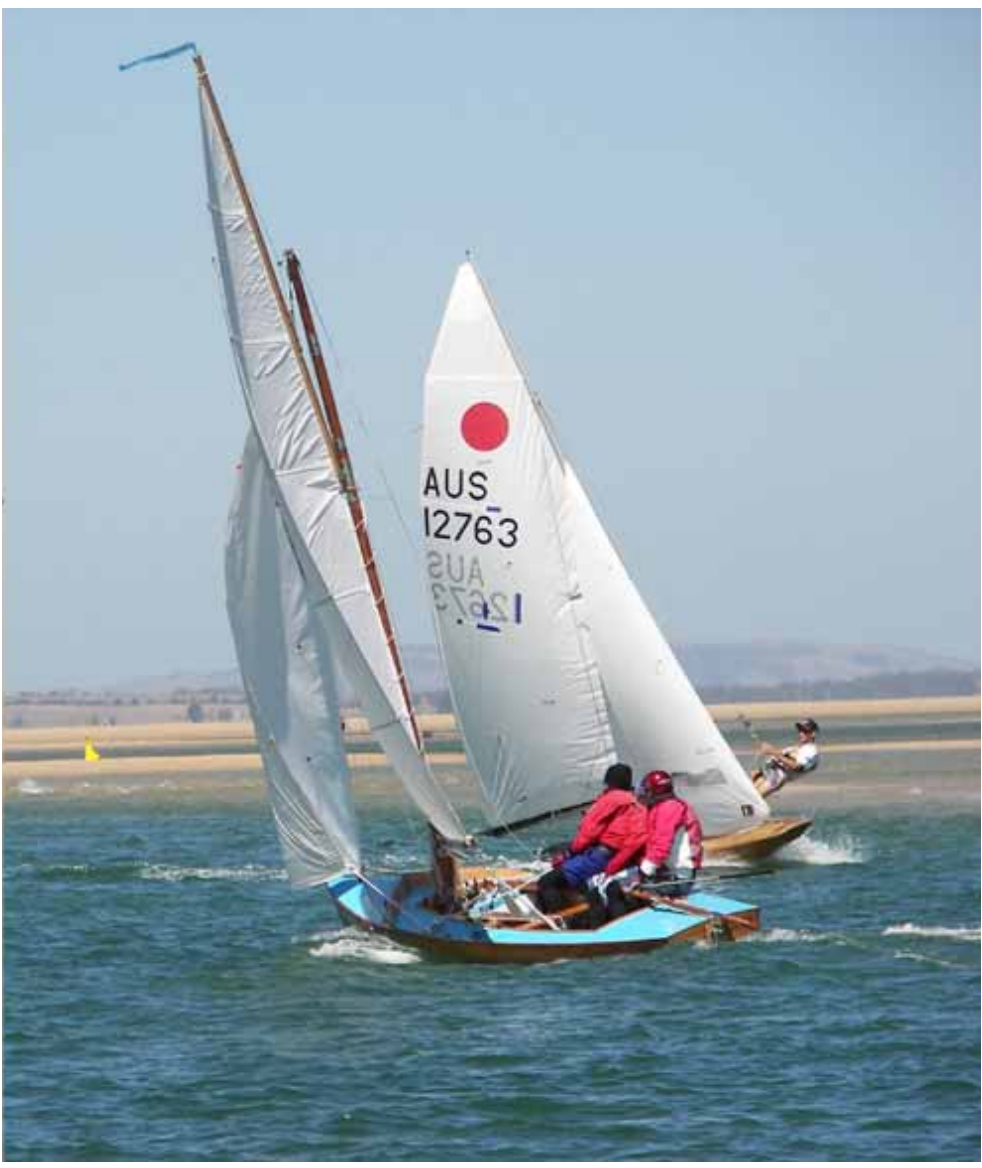
The Classic photo of the Classic Regatta - 12 Sq Metre and Fireball