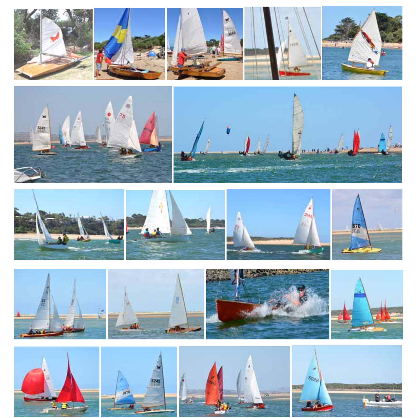
The link to the DVD Purchase information - http://driftmedia.com.au/2014/02/03/inverloch-classic-wooden-dinghy-regatta/