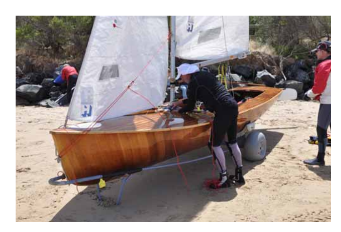
12 Sq Metre – Heavy Weight Sharpie