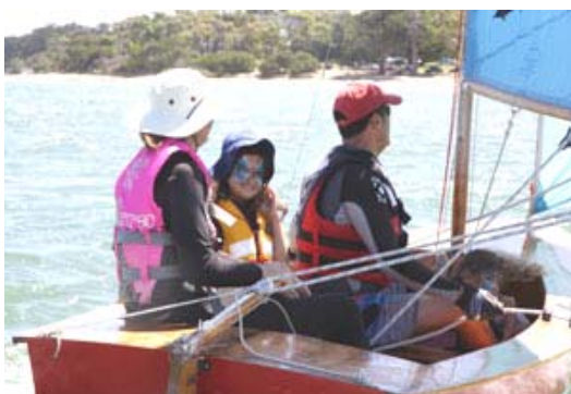
The Chapman Family's ' The Heron ' Heron 5028. Rotary Club Plaque and AUS Sails kit bag for Best Dinghy in Original Condition