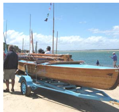
Stephen Fankhauser's ' Cheyenne ' a restored 12 Sq Metre. Rotary Club Plaque and AUS Sails kit bag for Best Presented Dinghy