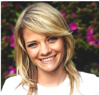
JESSICA WATSON OAM INVERLOCH CLASSIC WOODEN DINGHY REGATTA AMBASSADOR