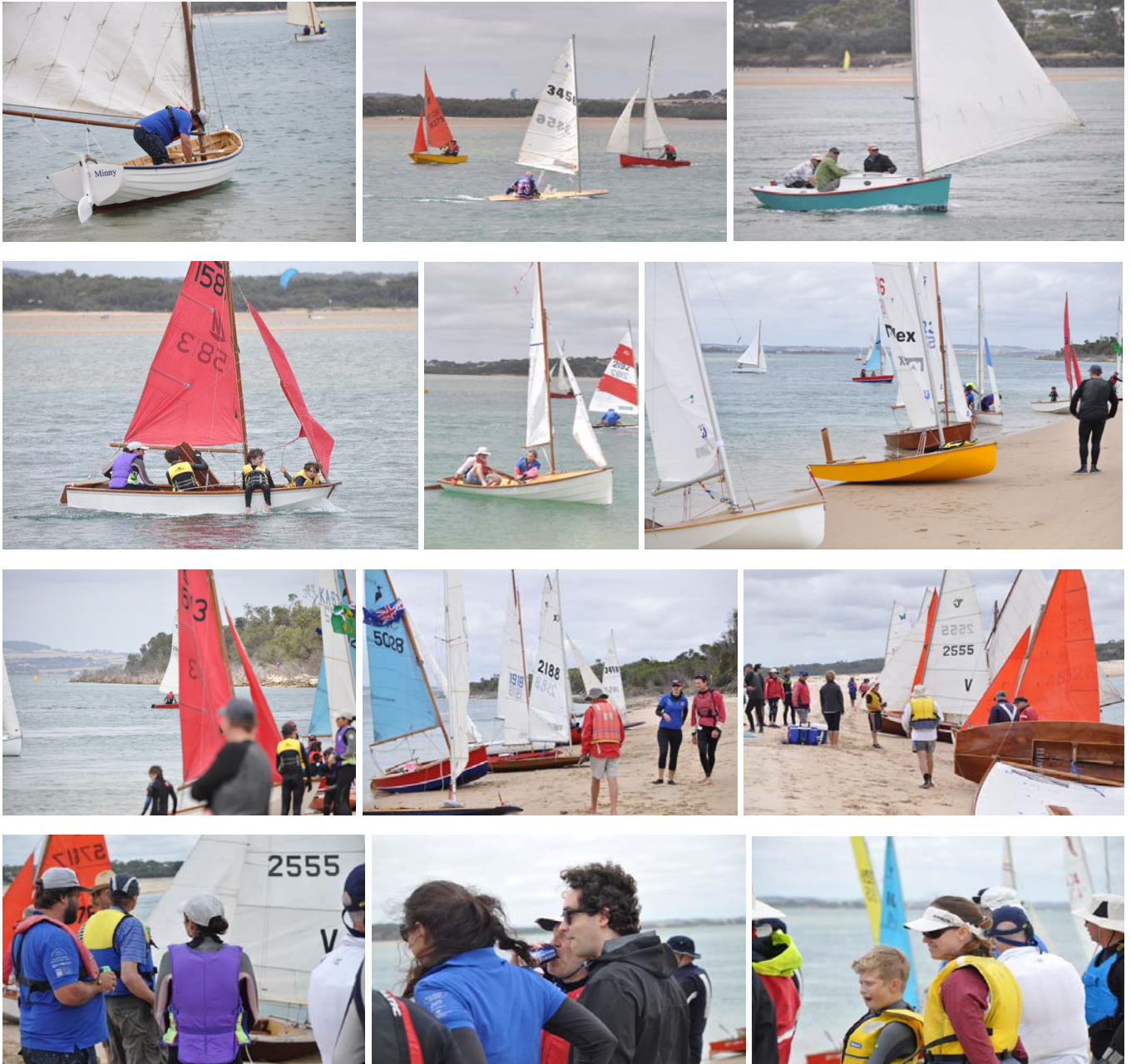
Sailors with classic wooden dinghies signing on for the Social Sail went into a draw for prizes.

On Thursday afternoon sailors launched their dinghies at the yacht club and sailed with family and friends up Anderson Inlet to view the scenery landing on Point Smyth to have a snack and drink. The social sail draw also took place.