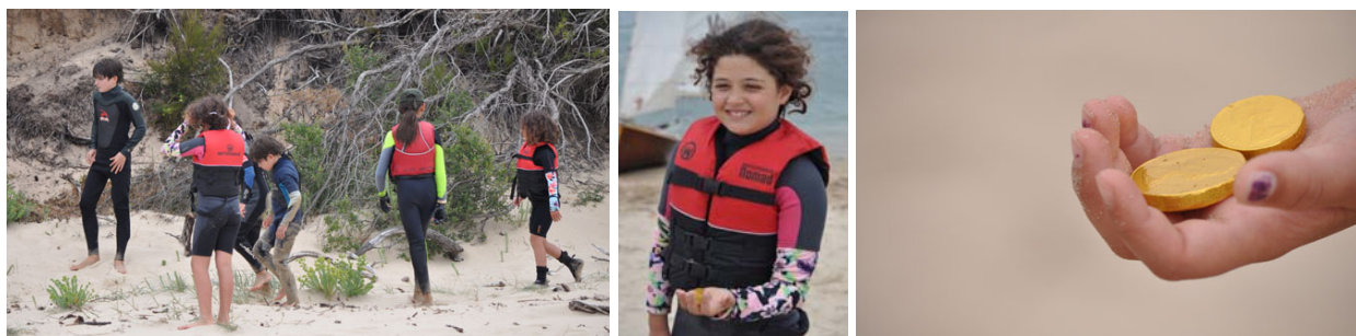
And young sailors hunted for treasure, which they were happy to share.